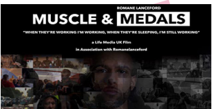
Muscle and Medals