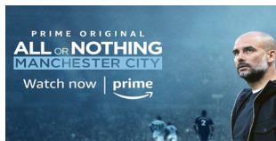
All or Nothing (Manchester City)