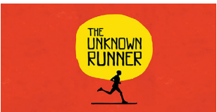
The Unknown Runner