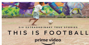
This is Football