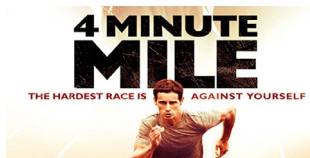
4 Minute Mile