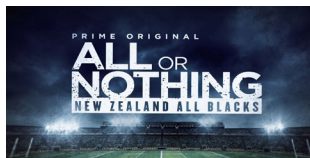
All or Nothing (New Zealand All Blacks)